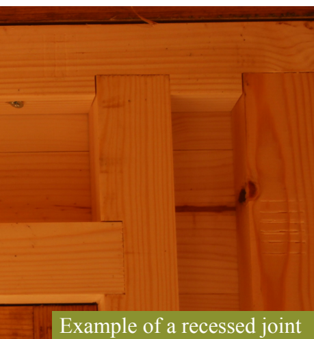
Example of a recessed joint

If you're looking for a larger building or need something more substantial, please ask to see our Log Cabin Range. We go up to 68mm timber thickness and a size of 22x14 feet!